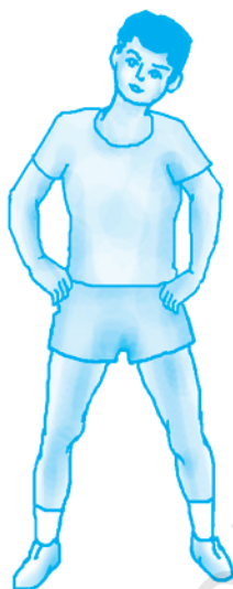
1. Head tilt (side to side)

Warming Up: Muscle stiffness is thought to be directly related to muscle injury and therefore, the warming up should be aimed at reducing muscle stiffness.